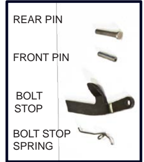
FACTORY PARTS USED WITH TIMNEY TRIGGER