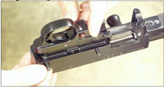
Removal and Installation of 10/22 Trigger Assembly