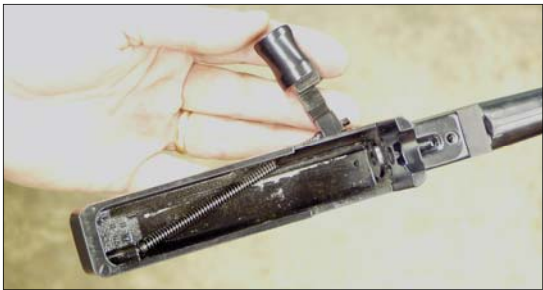
Installation of 17 HM2 Heavy Bolt Handle Assembly

The EABCO 17 HM2 Heavy Bolt Handle Assembly is absolutely necessary for safe and proper function when shooting 17 Mach 2 ammunition in a 10/22 that has been converted to 17 Mach 2 with the installation of an EABCO 17HM2 Target Barrel. This larger bolt handle is properly balanced and precision machined to properly time your 10/22 action for 17 Mach 2 ammunition. Do not attempt to fire 17 Mach 2 ammunition in any 10/22 rifle that has been converted to 17 Mach 2 from 22 long rifle without this bolt kit.