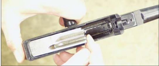
Removal and Installation of 10/22 Bolt Assembly